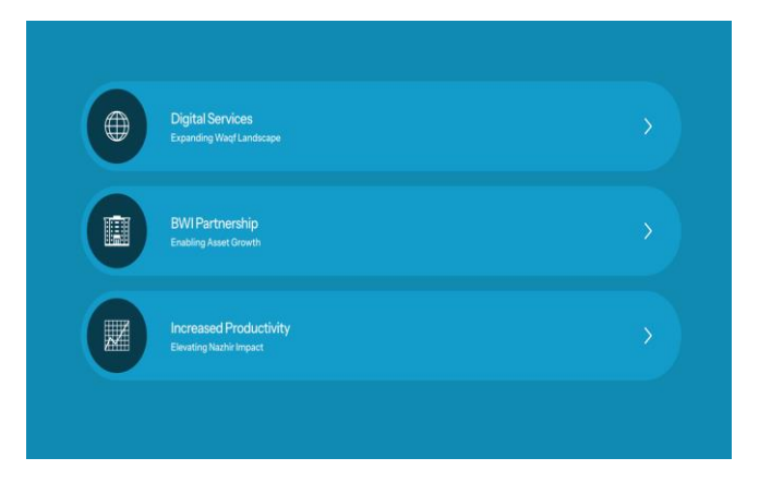
Fig. 2: Website Programs