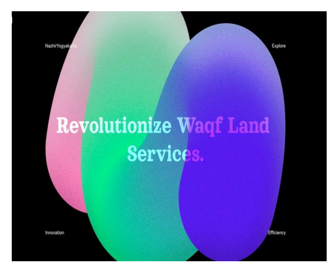
Fig.1: Main menu