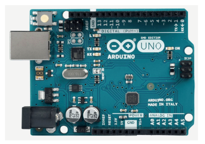
(Micro Controller - Arduino Uno)