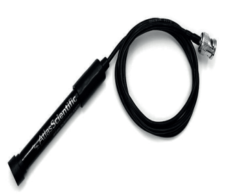
(Dissolved Oxygen Sensor)