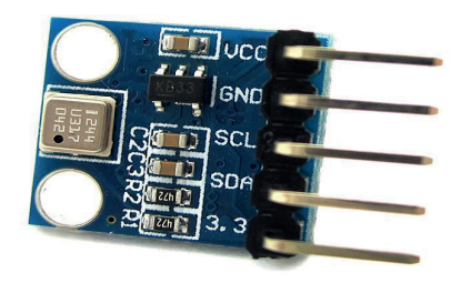
(Barometric Pressure Sensor)